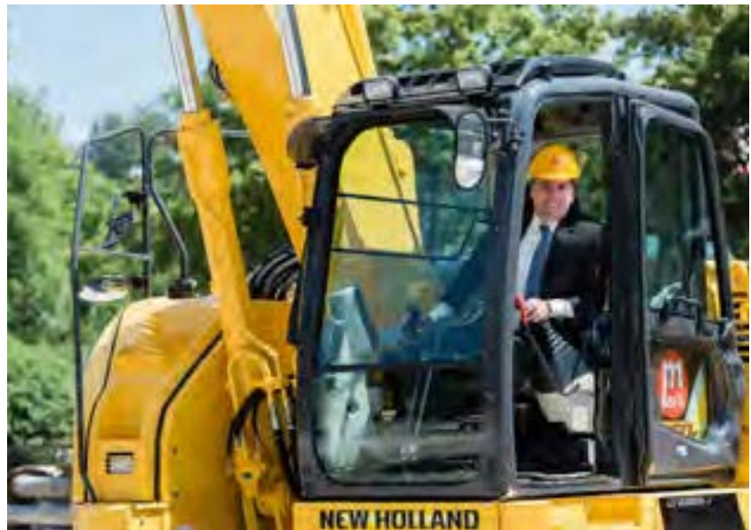
Sika CEO Jan Jenisch launches work on Sika's CHF 60 million new-build project at the company's Zurich site.

The site also has production facilities with 200 employees working in three-shift cycles to manufacture adhesives that are destined primarily for the automotive industry and are crucial to trends in automobile construction, such as light-weight assemblies, a reduction in weight and energy consumption, lower CO 2 emissions and increased safety. One in every four windshields produced worldwide is bonded using Sika products, as are four of the five car bodies voted the most innovative in 2013, i.e. the Mercedes S-Class, the BMW i3, the Lexus IS and the Range Rover Sport (source: Automotive Circle International, EuroCar Body Awards 2013).