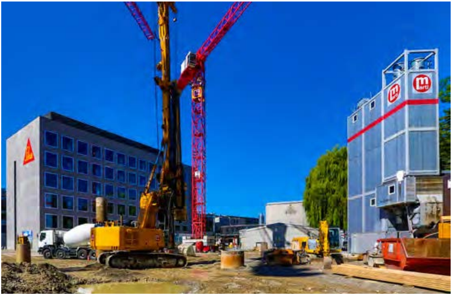
The new building in progress.

hesives for the automotive industry and sealants for construction applications.