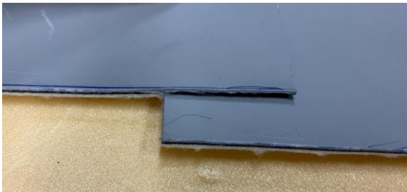
Figure 1 (overlap)