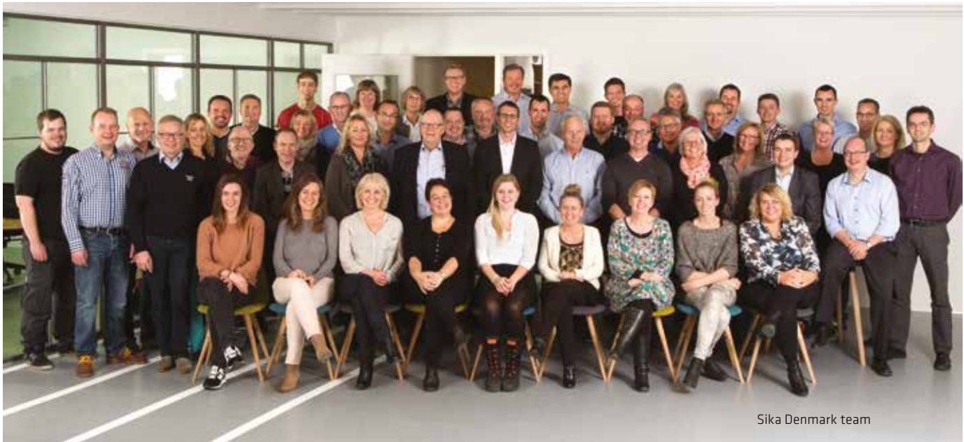
Sika Denmark team

It's windy in Denmark, which helps explain why Denmark is so skilled at capturing the power of the wind. Relying on 28% wind power for its electricity system, Denmark is a nation that many others are looking to in order to discover sustainable energy solutions for the future. However, plentiful wind is not necessarily synonymous with a strong wind industry. Denmark's achievement in bringing 28% wind power into the electricity system is built on several key factors, that together have made Denmark the world's wind power hub. Denmark's role as a first mover in both onshore and offshore wind power has been important. The lessons learned through the early years of setting up wind turbines across the nation have been pivotal. The industry has developed through innovative thinking and experience, which have helped create core competencies in the production, design and installation of wind turbines that are sought after worldwide. To date, Danish companies have installed more than 90% of the world's offshore wind turbines. The wind industry today is part of the backbone of the export earnings of the Danish economy.