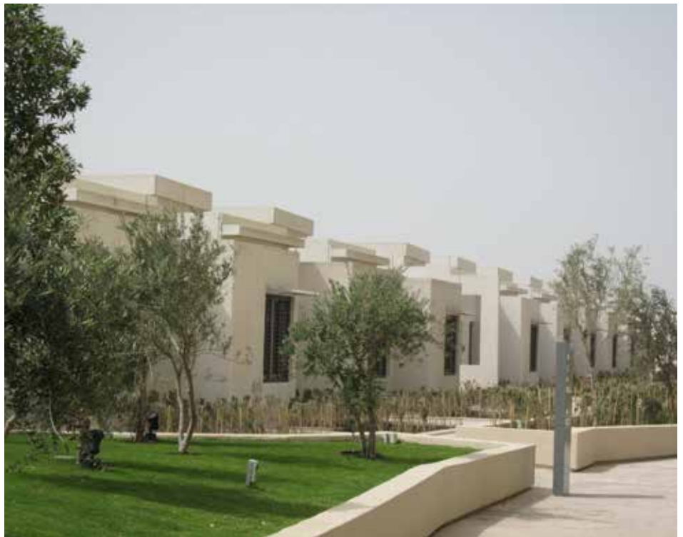
The housing complex covers 868 apartments that range from single-bedroom units to penthouses spread over five luxurious residential towers and 14 premium villas.

The clubhouse has an origami concept design. It also houses a selection of retailers which residents can patronize, including a supermarket, a laundry, a beauty lounge, a pharmacy and a coffee shop. This new mode of community living sounds quite attractive, doesn't it? <