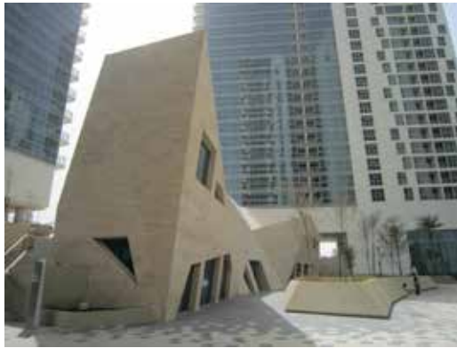
The clubhouse has an origami concept design.