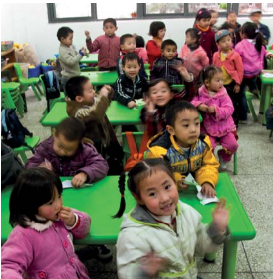
Children in Jinyan School are happy about their new laboratory building

Generally the labor resources of the Chinese market reflect a shortage, especially of blue collar workers. For the specific requirements of our industry, qualified professionals are sometimes also difficult to find. So campus recruiting, people & organization development (i.e. succession planning, process improvement) have become major topics when it comes to supporting our business growth.