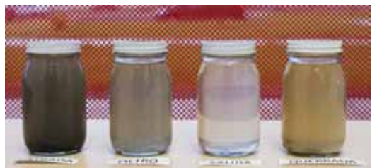
The third glass shows the final result of the purification process.

biological and chemical processes, it is recovered in compliance with environmental guidelines so it can be discharged back into a river.