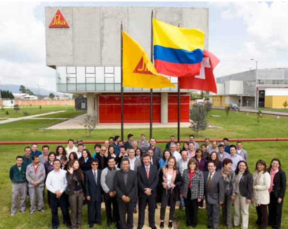
Proud employees of Sika Colombia

In order to complete the value chain, the waste is also recycled for compost production to generate humus, which is used for gardens and by tree nurseries in the neighborhoods. There is only one waste material from industrial water that is disposed of as debris. Environmental care and sustainability of industrial activity diminishes the impact on natural resources, is cost effective and improves environmental responsibility. The target of the second phase of this water program is to have zero waste. Sika is now sending a request to the local environmental authorities for a license for further development.